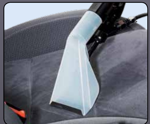
Hand held upholstery nozzle

Simple, clean and efficient. This unique design allows an easy to fill and quick to change system.