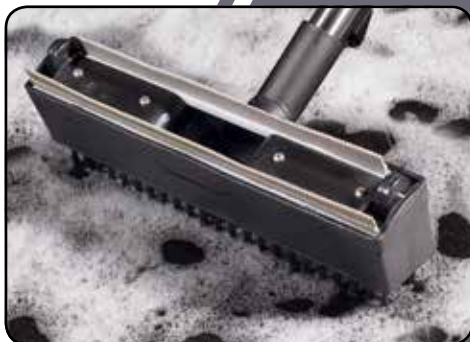
Reversible scrub head