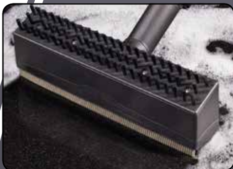
Reversible squeegee head